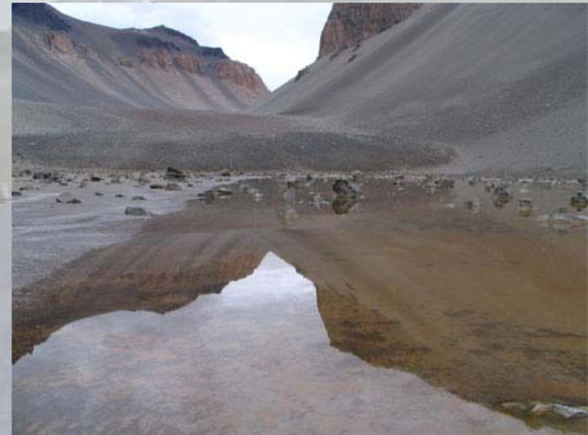
Don Juan Pond