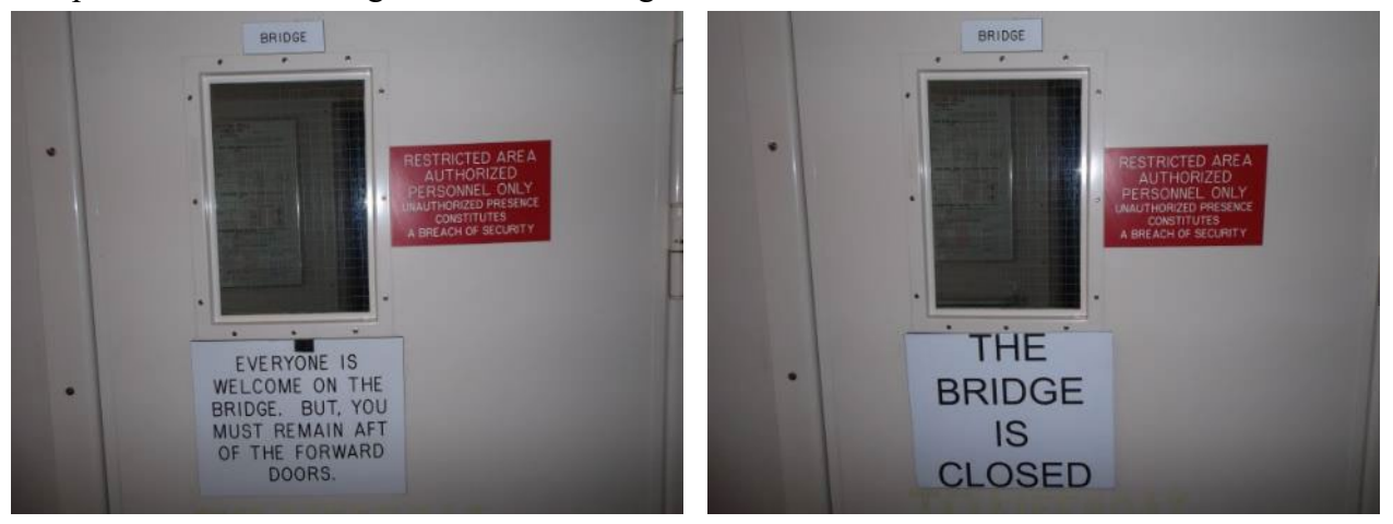
Figure 9: LMG Bridge Placards

You are always welcome on the Bridge except during maneuvers, when there is a pilot on board or the Captain closes the bridge. When Bridge access is restricted, signs will be posted and/or a red light outside the bridge door will be illuminated.