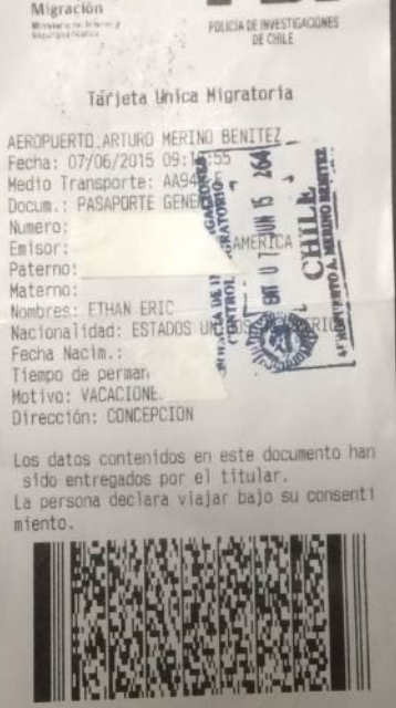
Figure 8: Chilean PDI slip

your passport will be stamped and you will be given a tourist card or PDI slip (Policia de Investigaciones de Chile (Spanish: Investigative Police of Chile) (see below).