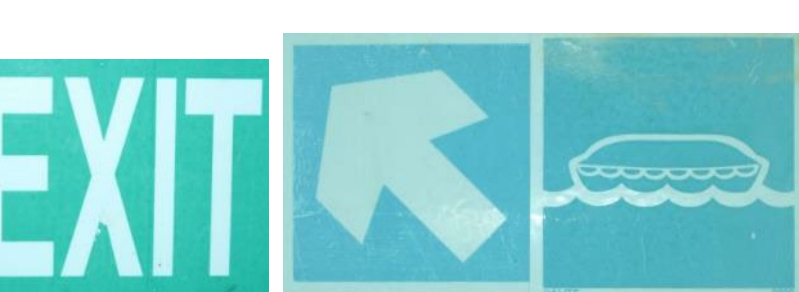
Figure 3: Egress Arrow, EXIT Sign (to weather deck), and Life Boat Arrow

Each compartment has an Emergency Escape Route diagram, as exemplified in figure 4. Familiarize yourself with these diagrams, especially those in cabins and work spaces.