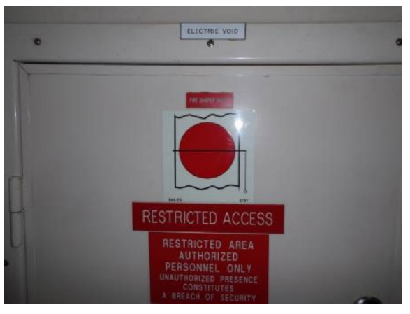
Figure 10: Example of "Restricted Bridge Access" Placard

The Engine Room can be a dangerous place for even the most experienced personnel. All visits are to be arranged in advance, and are best coordinated through the chief engineer.