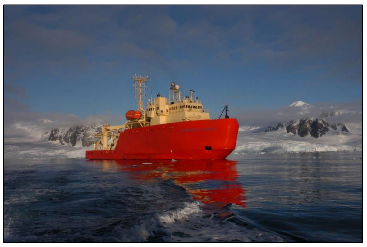
Figure 2: The ARSV Laurence M. Gould