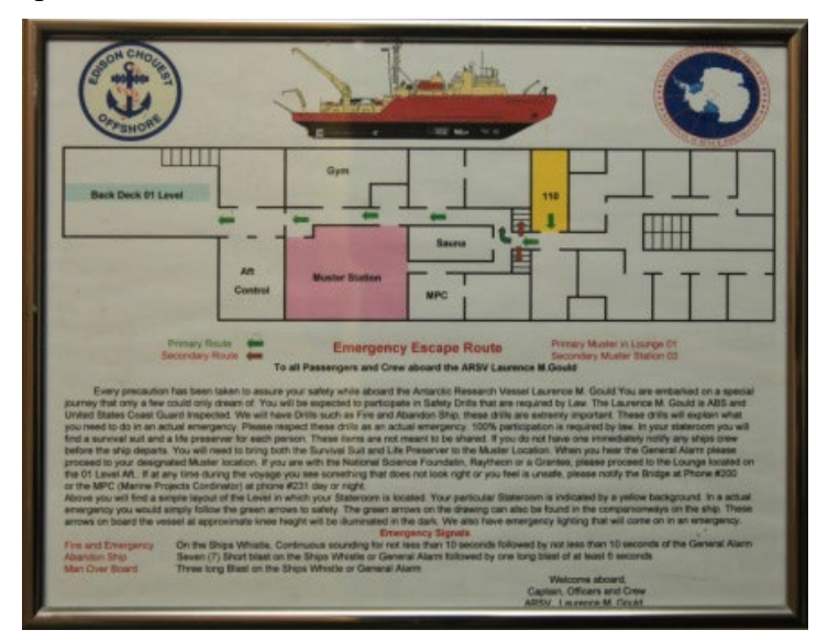
Figure 4: Example Emergency Escape Route Diagram

Each compartment has an Emergency Escape Route diagram, as exemplified in figure 4. Familiarize yourself with these diagrams, especially those in cabins and work spaces.