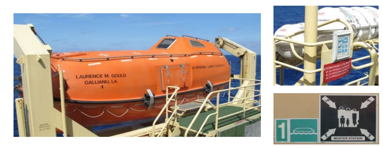
Figure 5: Lifeboat, and Lifeboat Station Signage

In addition, both vessels have three life rafts on the port side and three on the starboard side. These are contained in the white cylinders pictured above. These rafts can be launched manually by ship's crew or will deploy automatically by hydrostatic release when the ship reaches 12 to 15 feet below the sea surface.