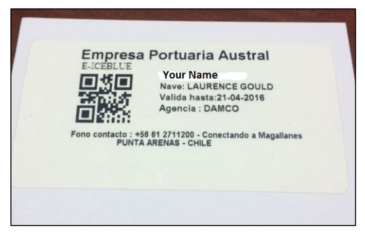
Figure 7: Prat Pier Access Card

In order to access Prat Pier, you will be issued a pier access card by a DAMCO (ASC port agent) representative. This pass is only good for the dates you are in port.