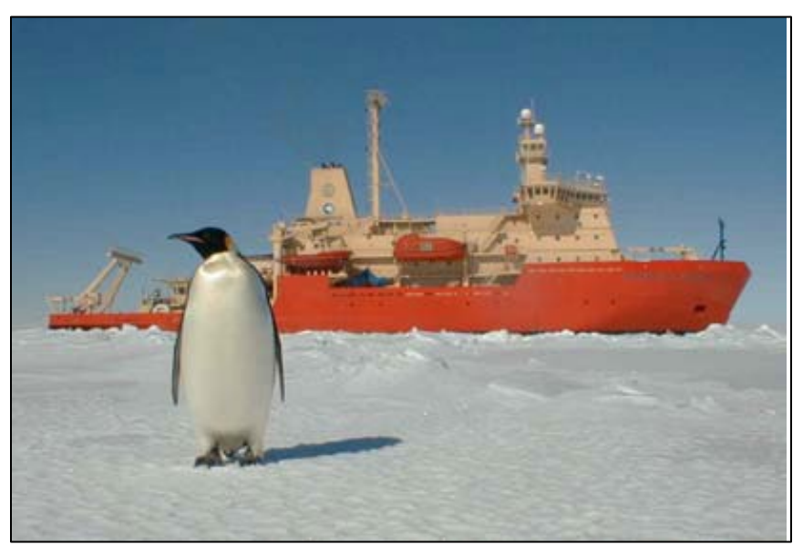
Figure 1: The RVIB Nathaniel B. Palmer (and friend)

ASC manages the ships through the means of a time charter with the owner, Edison Chouest Offshore, Inc. (ECO). ECO provides for the safe operation and maintenance of the ships, and assists in the efforts of the scientific program on board.