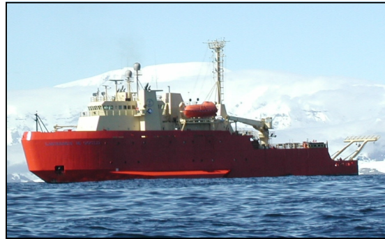
Traveling within Antarctica can introduce non-native species to other sites.

For more information: Contact the Environmental staff of the United States Antarctic Program