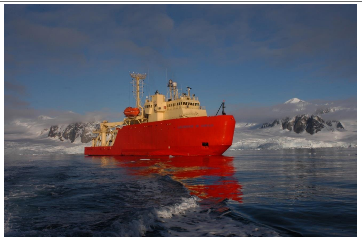
Figure 2: The Laurence M. Gould