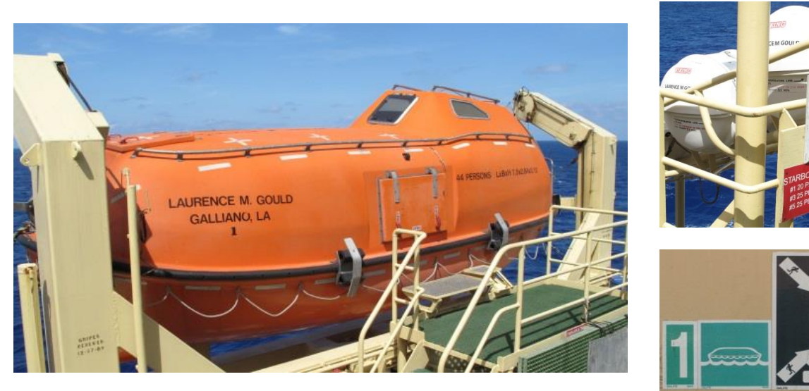
Figure 5: Lifeboat, and Lifeboat Station Signage

There are two rigid lifeboats on board, one on the portside and one on the starboard side. If the Captain orders an " Abandon Ship " you will be directed from your muster station to one of these lifeboats. Each lifeboat on the NBP is capable of carrying all personnel aboard the vessel. The LMG's lifeboats can accommodate 44 persons. Therefore, depending on a particular cruise's crew size, both lifeboats may be required on the LMG in the event of an emergency.