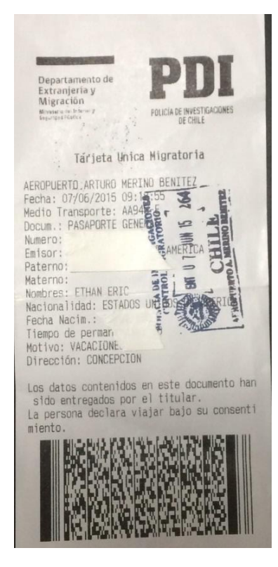
Figure 8: Chilean Customs Form

Those deploying to the LMG or NBP will usually embark in the town of Punta Arenas, Chile. Upon clearing customs in your point of entry (usually Santiago), your passport will be stamped and you will be given a customs form (see below).