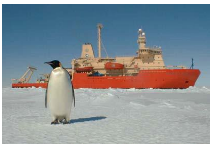
Figure 1: The Nathaniel B. Palmer (and friend)

ASC manages the ship through the means of a time charter with the owner, Edison Chouest Offshore, Inc. (ECO). ECO provides for the safe operation and maintenance of the ship, and assists in the efforts of the scientific program on board.