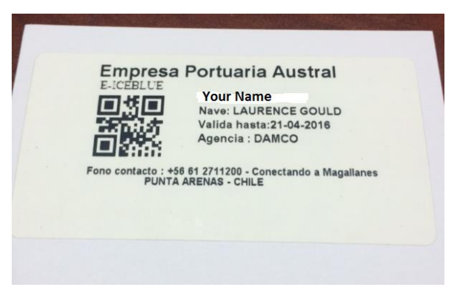
Figure 7: Prat Pier Access Card

You must stay within pedestrian walkways between the front gate and the ship unless you are wearing additional personal protective equipment.