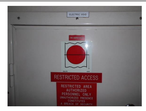
Figure 10: Example of "Restricted Bridge Access" Placard