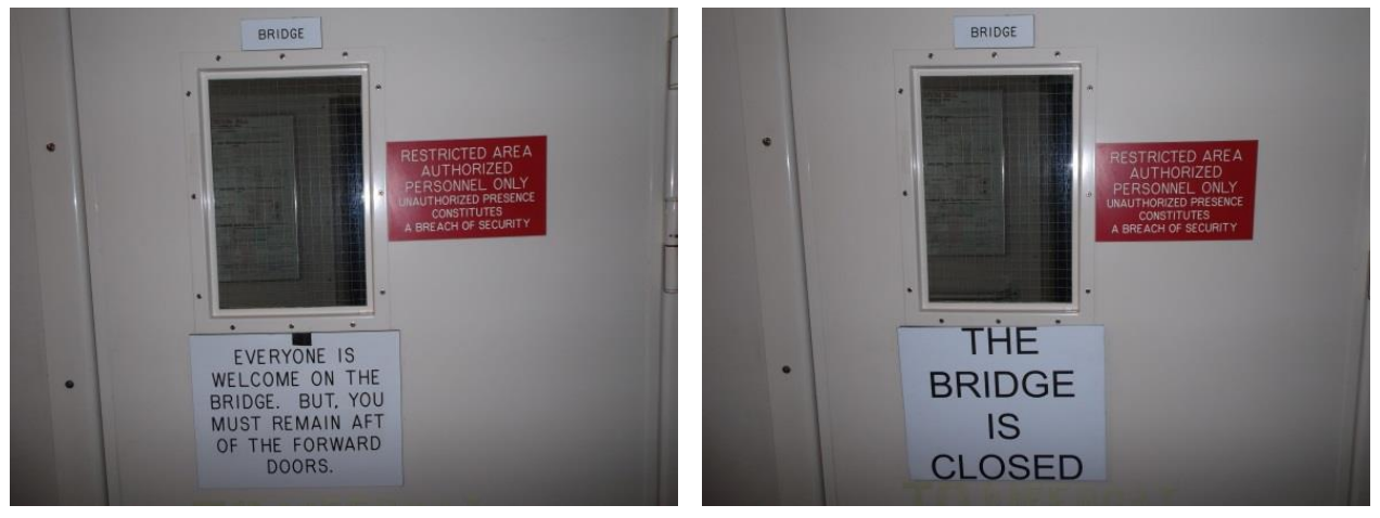
Figure 9: LMG Bridge Placards

You are welcome on the Bridge at all times except during maneuvers, when there is a pilot on board or the Captain closes the bridge. When Bridge access is restricted, signs will be posted and/or a red light outside the bridge door will be illuminated.