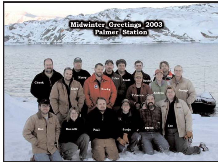
Typical winter greeting from Palmer Station. Many of the same people are back this year.

At the British Rothera Station, the entire week before Midwinter’s Day is dedicated to preparations, with all but the most necessary station duties put on hold while people plan games, go skiing and secretly work on a handmade gift for the exchange, such as picture frames made from old