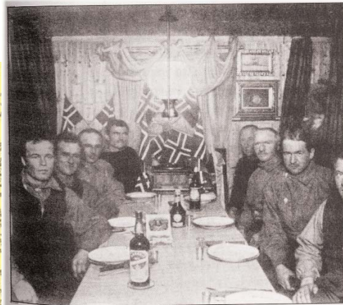
Below, the midwinter photo sent this year from the South Pole.

From the midwinter feast shared by Roald Amundsen and his crew below, to the cabled greetings sent between stations since the 1950s, Antarctic winter traditions continue.