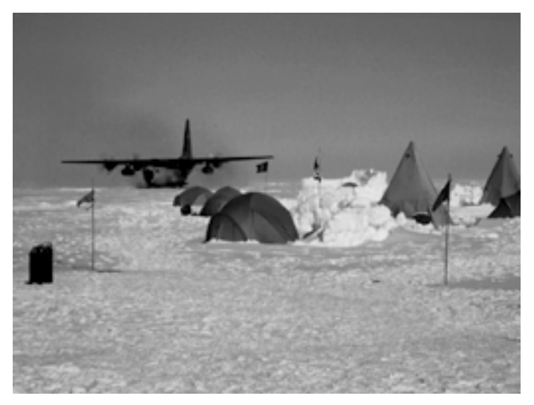
Figure 7-1: LC-130 at Remote Field Camp.