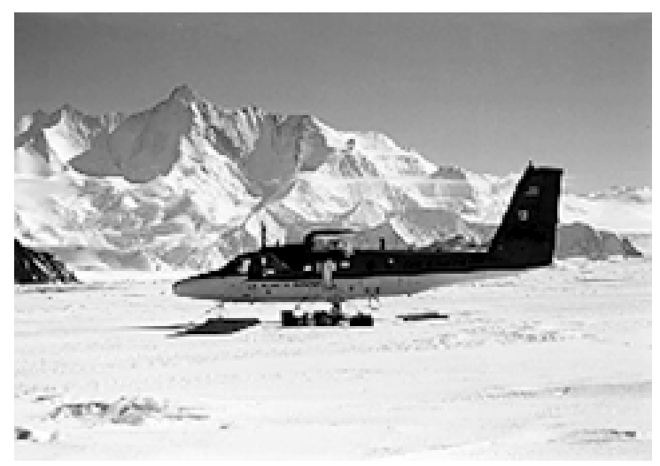
Figure 7-2: Twin Otter aircraft

Identify any and all hazardous items in your field gear, including science supplies, BFC equipment, and MEC equipment, at least 72 hours before the day of your flight. Put them together in one pile in your cage, and give a list to the BFC. If you're unsure what is hazardous, ask USAP Cargo personnel for assistance. It is the responsibility of USAP Cargo to package all hazardous materials in accordance with regulations. The BFC staff will assist you in submitting and staging hazardous cargo, which will remain in the possession of USAP Cargo personnel until the day of the flight.