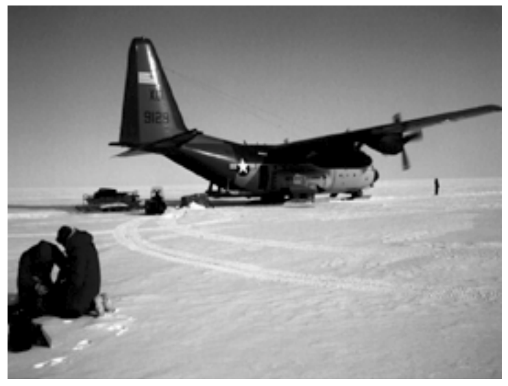
Figure 7-3: Establishing communications with a fixed station.

areas of Antarctica and McMurdo is poor. Sometimes it is necessary for field parties to relay between South Pole Station, a major field camp, or another remote field party for daily check-in. See Chapter 9: "Field Radios" for more detailed information on communications.