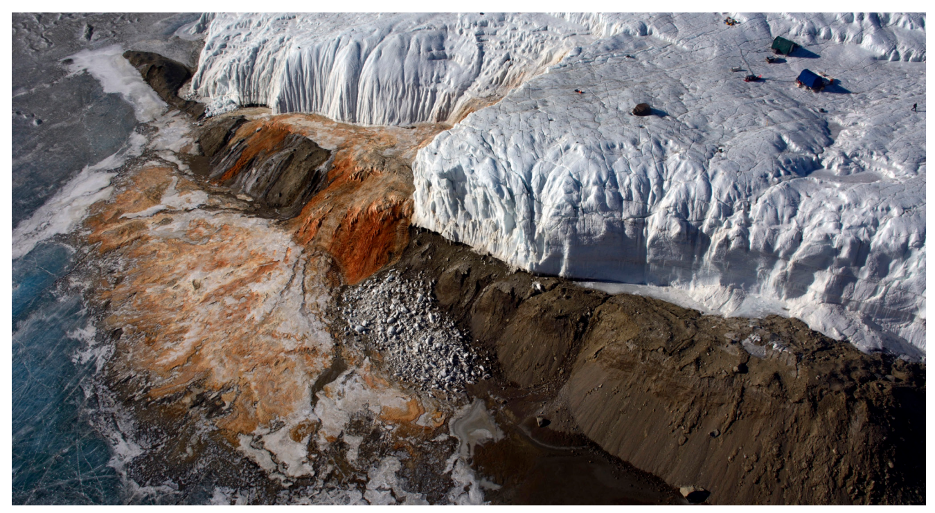
Blood Falls is a unique feature where iron-rich brine from the substrate is released at the terminus of the Taylor Glacier. Any work within the protected area of Blood Falls requires an ACA permit.

U.S. environmental conservation and waste management laws apply in Antarctica. This chapter describes environmental impact assessments and the Antarctic Conservation Act, and it explains how to get a permit for certain activities. The chapter also discusses the shipment of science cargo, and it explains permitting rules that apply to cargo, including specimens shipped from Antarctica.