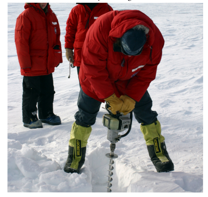
Sea ice safety training teaches participants how to determine the thickness and condition of the sea ice and whether it is safe for travel.

Generally, people leaving the established road system in and around McMurdo Station must complete training appropriate to their expected exposure, previous training, and experience. Some courses are tailored to the needs of each team, such as those spending their time in the Dry Valleys, working on sea ice, or traveling long distances by snowmobile.