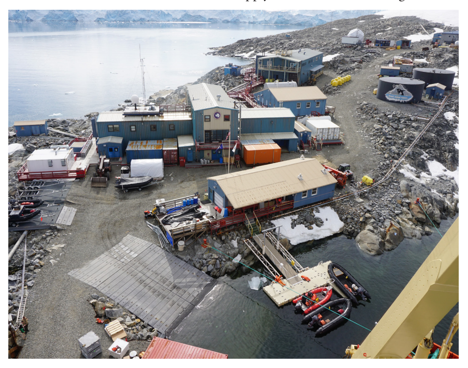
Palmer Station, on Anvers Island in the Antarctic Peninsula region, is the smallest of the three permanent U.S. stations.

Station store. The store stocks a limited supply of toiletries and beverages. Antarctic and South Pole souvenirs are