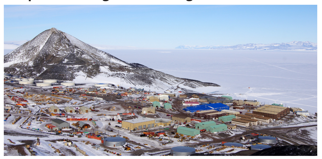
McMurdo Station is the largest station in Antarctica and the southermost point to which a ship can sail. This photo faces south, with sea ice in front of the station, Observation Hill to the left (with White Island behind it), Minna Bluff and Black Island in the distance to the right, and the McMurdo Ice Shelf in between.

USAP participants are required to put safety and environmental protection first while living and working in Antarctica. Individuals are also responsible for their personal behavior, and are expected to behave responsibly. This chapter contains general information that applies to all Antarctic locations, as well as information specific to each station and research vessel.