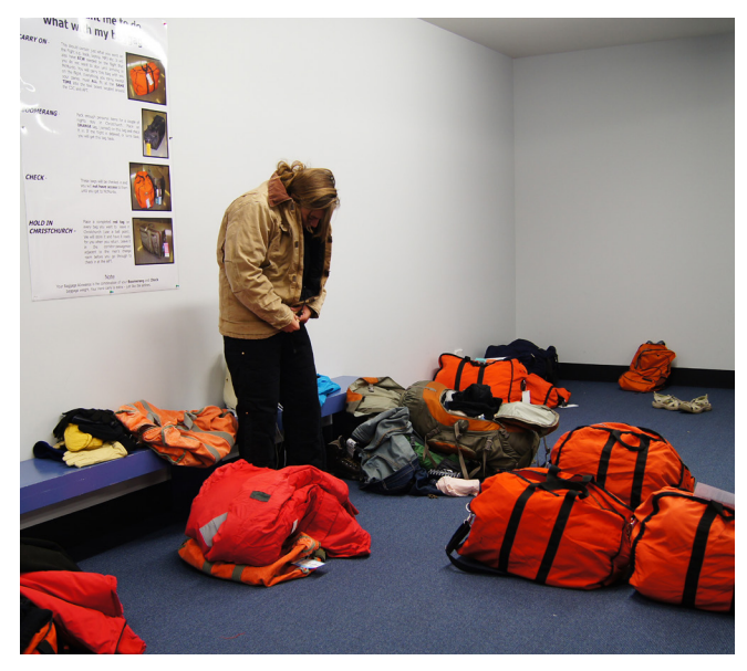
A participant tries on ECW gear during clothing issue at the CDC in Christchurch, New Zealand.

The type and amount of clothing you receive depends on where you work. Most, but not all, ECW clothing is mandatory. Participants who have recently deployed through USAP may substitute some or all of the USAP-supplied ECW gear with their own clothing. If you are new to the program, you must take all the clothing issued to you according to the <u>USAP ECW Policy</u>.