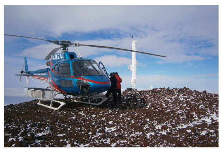
A helicopter brings researchers to an Automatic Weather System outside of McMurdo Station.