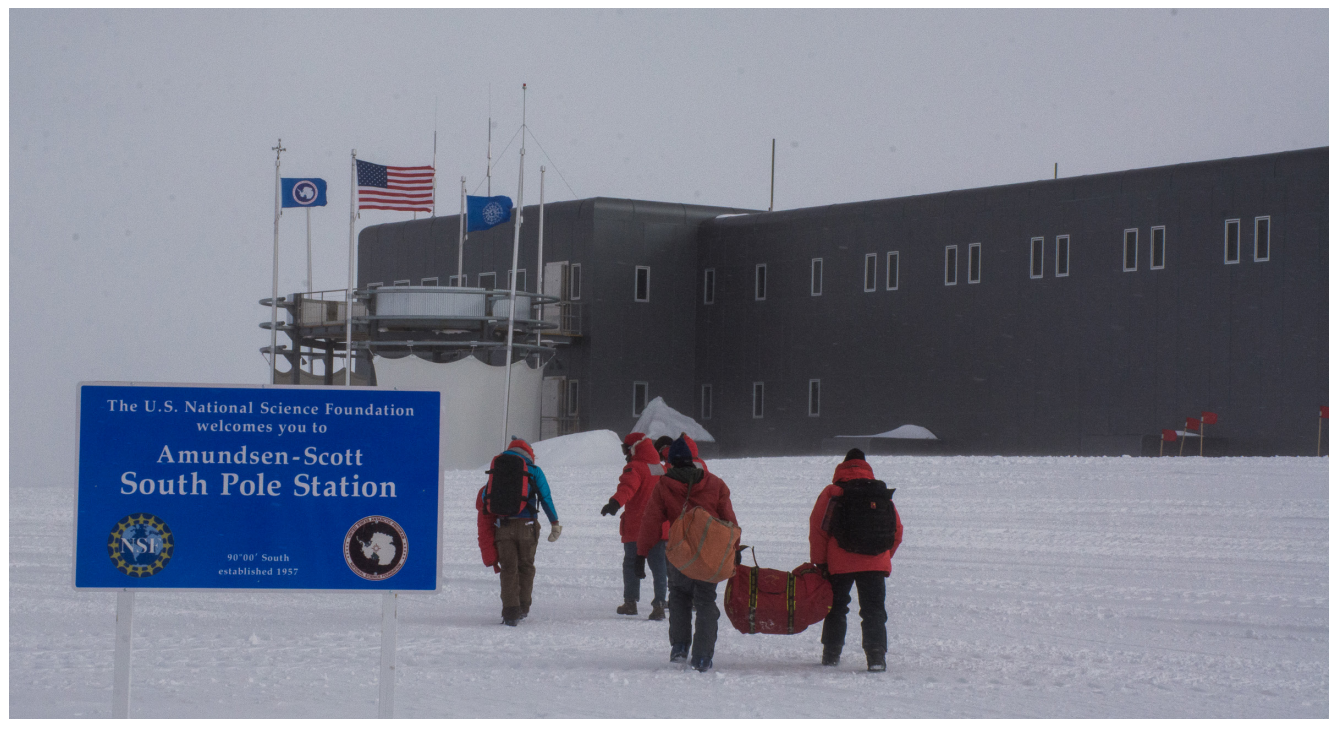
USAP participants carry their bags to the elevated station after arriving at the South Pole.

There will be several stops on your journey to Antarctica. Various transportation providers (U.S., foreign, military, vessel) have different baggage allowances and restrictions. Please adhere to the limitations set forth by each carrier. In New Zealand or Chile, you will pick up your USAP-provided extreme-cold-weather (ECW) clothing. You may require additional personal items for the various climates, types of work, and activities you will encounter. Planning is important. Read this chapter carefully.