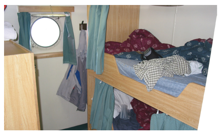
A cabin onboard the research vessel Laurence M. Gould.

with the appropriate agent. You should also ensure that any retrograde cargo is ready for transport. See Chapter 4: Retrograde (Return) Science Cargo.