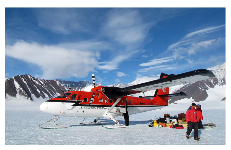
A Twin Otter delivering people and supplies to a deep-field camp.

South Pole. Grantees and employees traveling to the South Pole will coordinate their trip with the South Pole population specialist and station supervisor. Because of limited berthing, all participants going to South Pole must be approved by NSF well in advance of the trip.