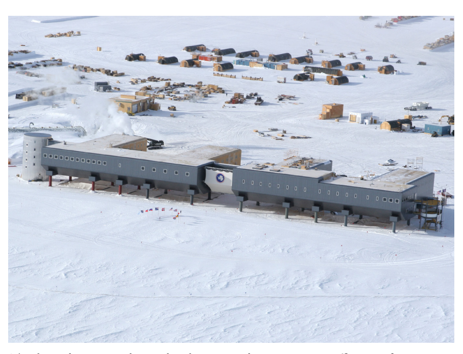
The elevated station at the South Pole contains dormitory rooms, offices, a cafeteria, a gym, a store, and a postal service center.

Medical. The McMurdo Clinic provides health care on both a walkin and appointment basis during posted hours, six days a week. Hours are posted at the entry and on the McMurdo intranet. For emergencies, staff can be reached 24/7 by calling 911. The facility is equipped to handle a wide range of minor illnesses and injuries and to stabilize critical patients for evacuation. Services include X-ray, laboratory, pharmacy, and nursing. A dentist is not available during the season, although one may be deployed near the end of the summer to help with winter-over PQ exams. During the winter, the physician has only limited capability to treat and manage dental and rehabilitation needs. The clinic has a limited pharmacy and does not provide over-the-counter medications.