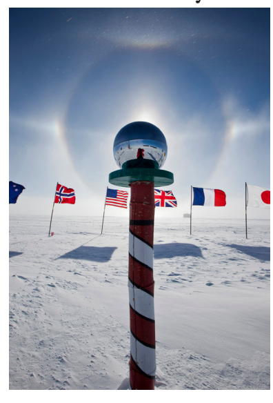
The ceremonial pole at Amundsen-Scott South Pole Station is surrounded by the flags of the original 12 signatory nations to the Antarctic Treaty.

The Antarctic Treaty entered into force in 1961, and its original 12 signatory nations included those that were active in Antarctica during the IGY. The treaty is a remarkable achievement whose primary success has been to reserve the area south of 60 degrees south latitude as a zone of peace. It prohibits measures of a military nature, including fortifications, and it prohibits nuclear explosions and the disposal of radioactive waste. It gives treaty parties the right to inspect all areas of Antarctica, including the stations, installations, equipment, ships, and airplanes of other member states to ensure continuing adherence to the treaty.