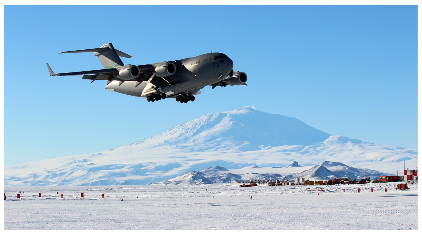
A U.S. Air Force C-17 aircraft lands near McMurdo Station.

This chapter gives travel advice for the foreign countries through which you might travel and explains how to obtain your ECW clothing and how to transport your baggage. The chapter also describes your arrival in Antarctica and your return from the continent.