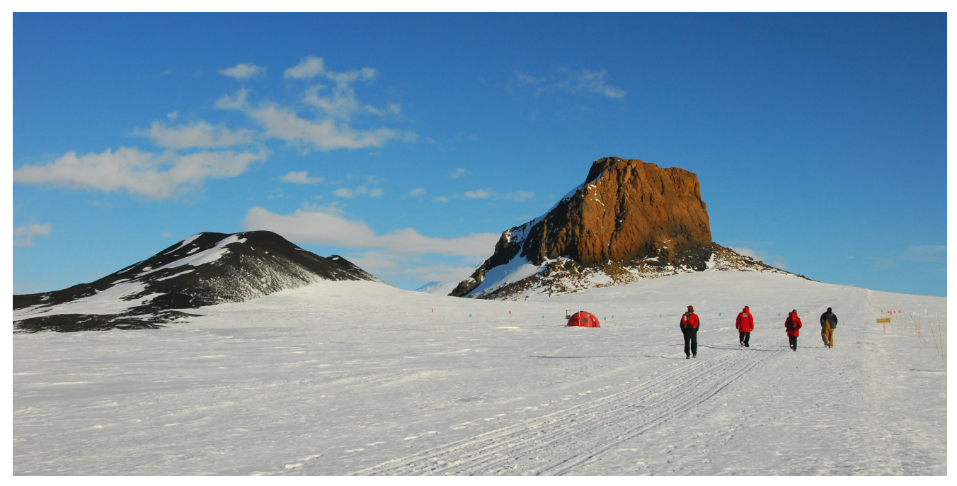
Hiking the Castle Rock loop, a 10-mile marked trail near McMurdo Station, is a popular recreational activity.

Altitude sickness. Amundsen-Scott South Pole Station and some field camps are at physiological elevations above 3,000 m (10,000 ft). The short flight from McMurdo doesn't allow time to acclimate en route. If you are assigned to these areas, you should check with your doctor to see if living at high altitudes will affect any preexisting medical conditions.