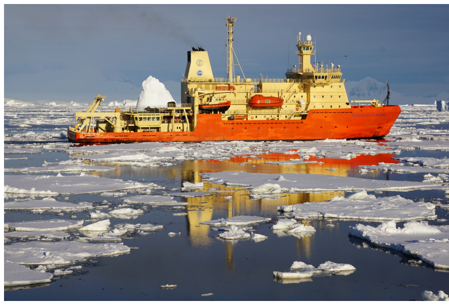
The research vessel Nathaniel B. Palmer.

Recreation. Facilities include an exercise room with weights and cardio equipment and a self-service bar with billiard and ping pong tables. There are arts-and-crafts supplies, and for outdoor recreation there is a limited