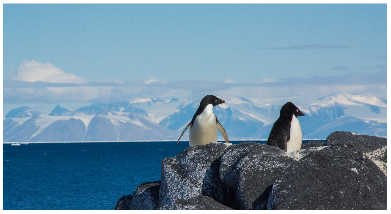
Adélie penguins at Cape Royds, Ross Island.

You will travel through at least one foreign country en route to Antarctica, and once in Antarctica you will be living in a region that does not provide many modern conveniences. Planning is essential and will contribute greatly to your effectiveness and comfort. You will require a passport and you will have to pass physical and dental examinations. Please read the following information carefully. Your supervisor, science team leader, or ASC point-of-contact (POC) will answer any questions you may have.