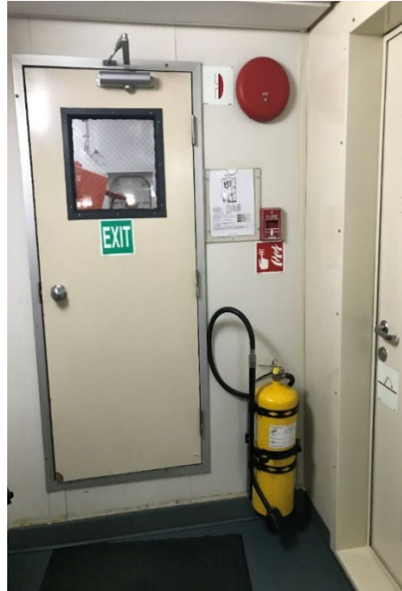
Figure 3: Class D Fire Extinguisher on LMG, next to the Door to the Baltic Room